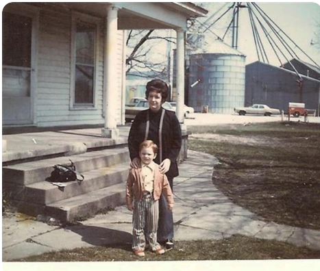
At Settlemyer Seed